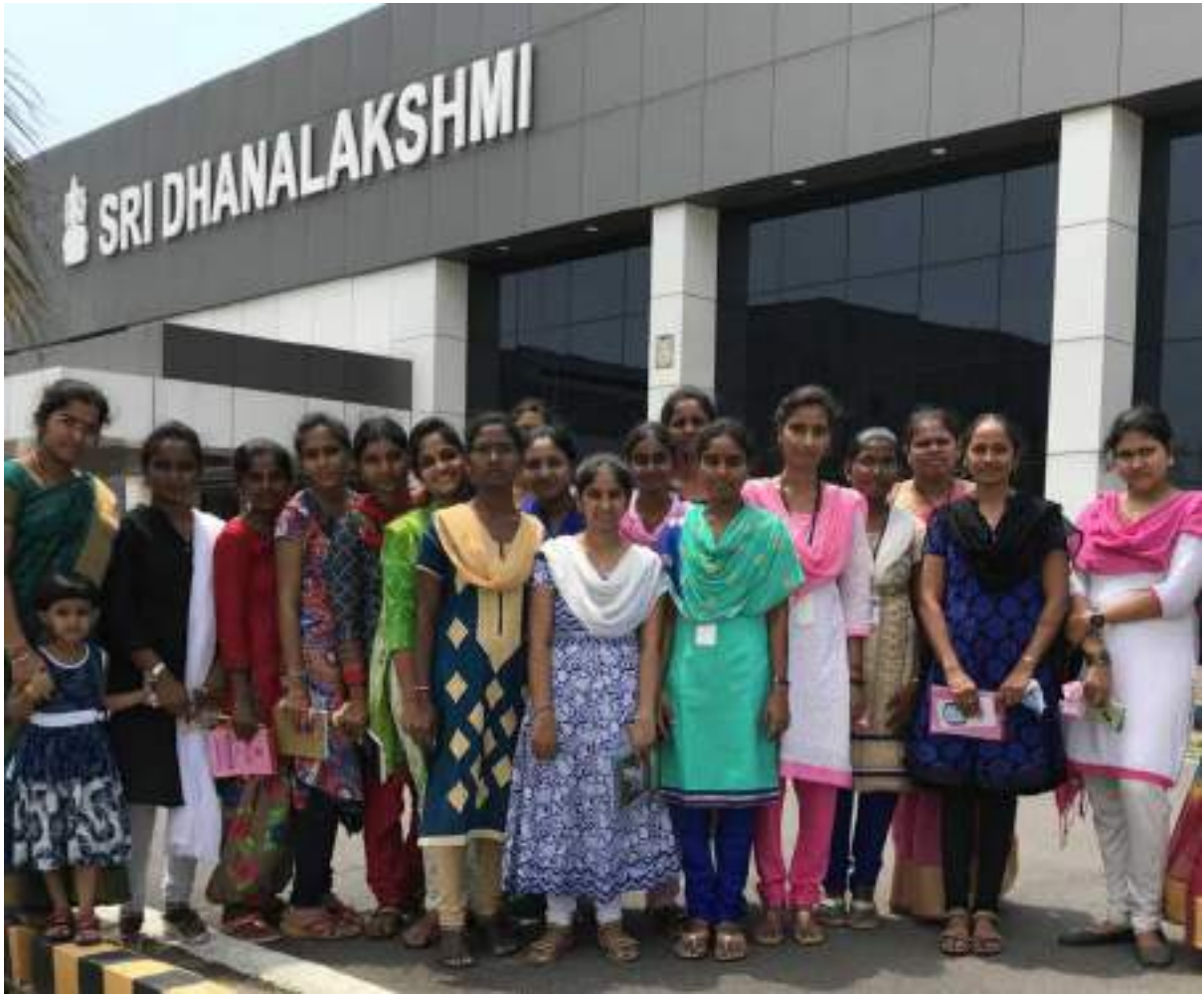
Recently our MBA Students visited SRI DHANALAKSHMI INDUSTRIES