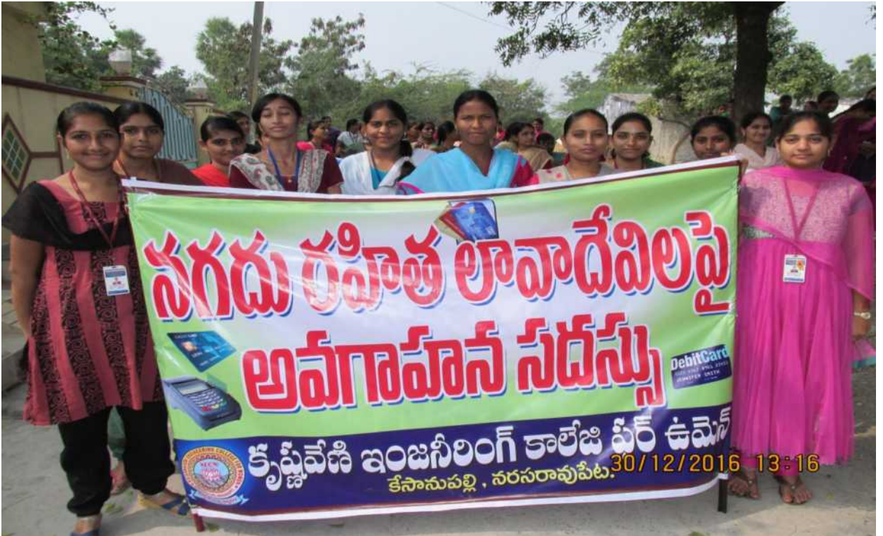
Awareness program on UPI payments conducted in Kesanupalli Village