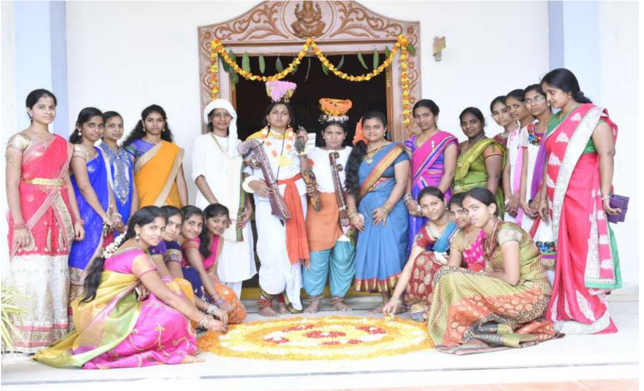
Pongal (Sankranti) Celebrations at College